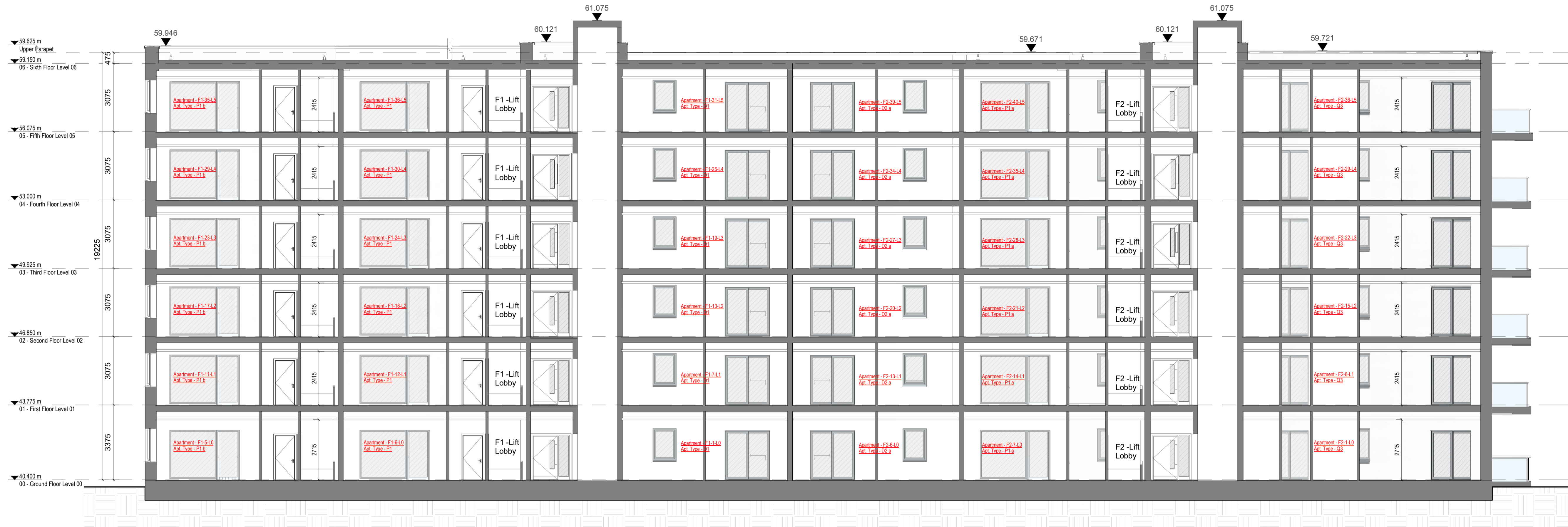
1 GA - Section AA